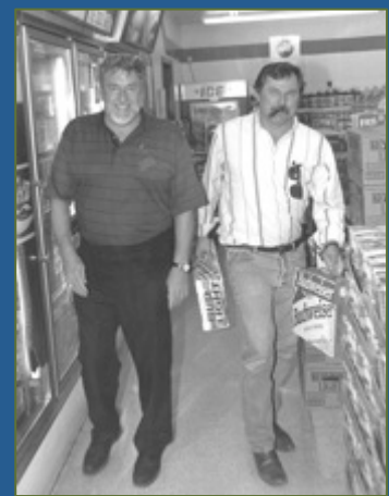
ASHRAE CRC Planning