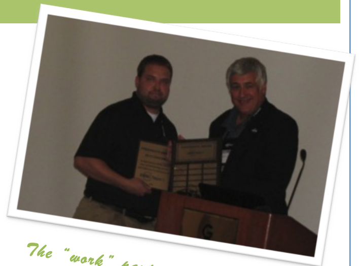
The "work" part of CRC. Collecting awards!