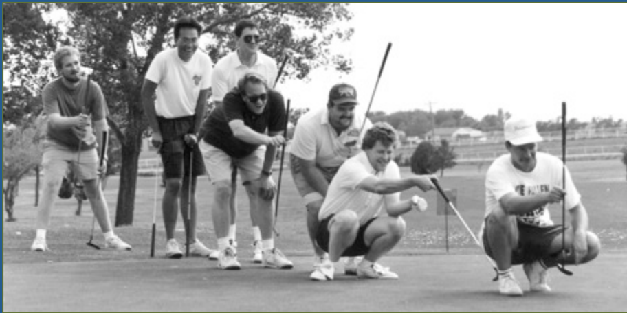
"Such a pure feeling is a well struck golf shot." -Roy McAvoy (Tin Cup) Meeting