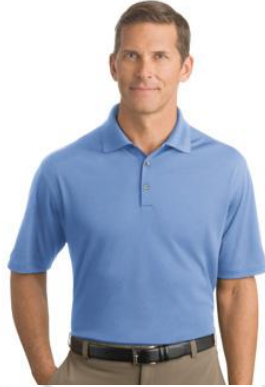
Nike Golf shirts $50.00