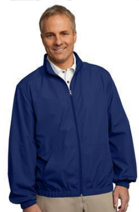
Windbreaker Jacket $30.00