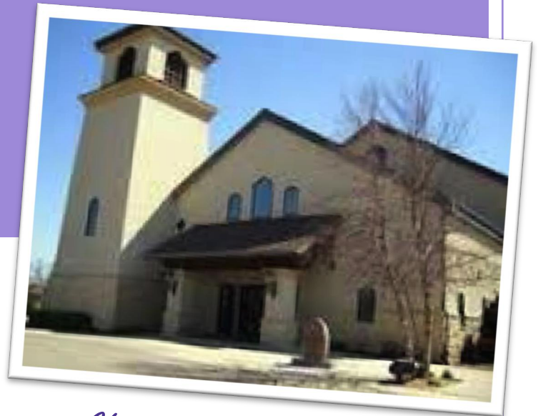
Church of the Resurrection