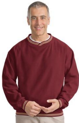
Wind Shirt Pull Over $55.00