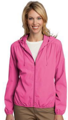
Windbreaker Jacket $30.00