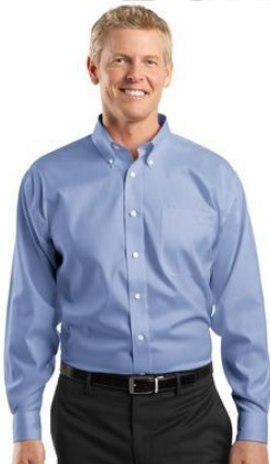
Long Sleeve Button Up $60.00